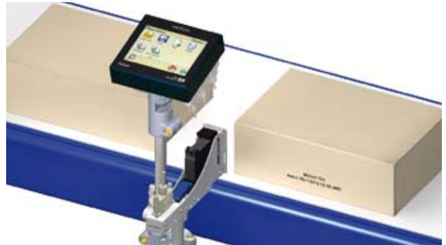
Mountings brackets as shown above are available in different configurations.

Please note that for the MiniTouch controller only the new 'F'-type printheads can be used.