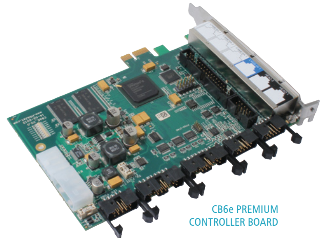
CB6e PREMIUM CONTROLLER BOARD

The combination of hardware and software provides a powerful printing solution for integrated and turnkey applications.